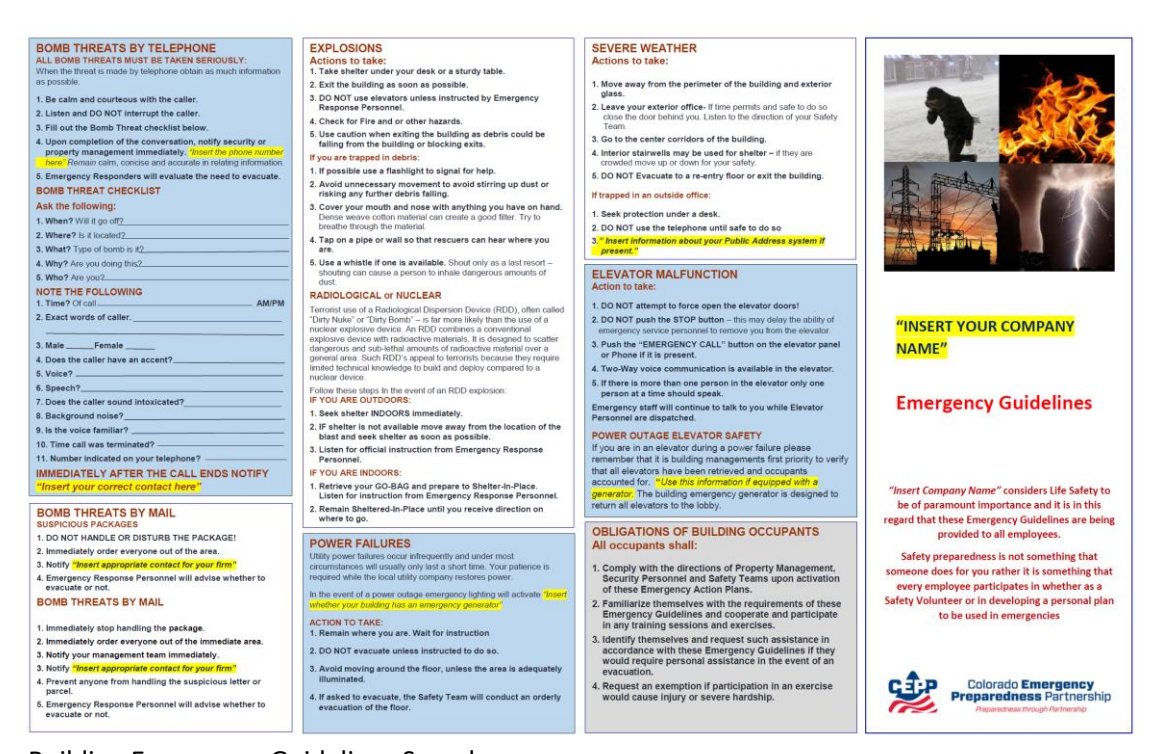
Building Emergency Guidelines Sample

CEPP's initial pilot program is with the Denver Metro Chamber of Commerce to update their own emergency plans and has demonstrated it to the International Facility Management Association (IFMA) and to Brookfield Properties. In 2017, CEPP plans to offer workshops around the state on this program.