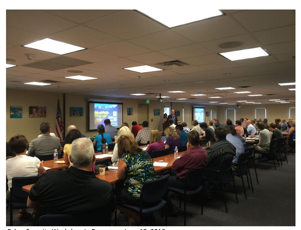
Cyber Security Workshop in Denver on June 19, 2016

CEPP partnered with the State's Division of Homeland Security and Emergency Management (DHSEM), FEMA Region VIII, and the Colorado Federal Executive Board (CFEB) to provide quarterly cyber security workshops around the state. In January, workshops were held to highlight what federal resources are available to all organizations to increase their cyber security plans and in April, state resources were presented. In June, cyber risk and cyber insurance were discussed and in October, the Department of Homeland Security's Colorado Cyber Security Advisor showed how the National Institute of Standards and Technology's Cyber Security Framework can help organizations create their own plan. These workshops educated organizations on what the threat is and what free resources are available to them now.