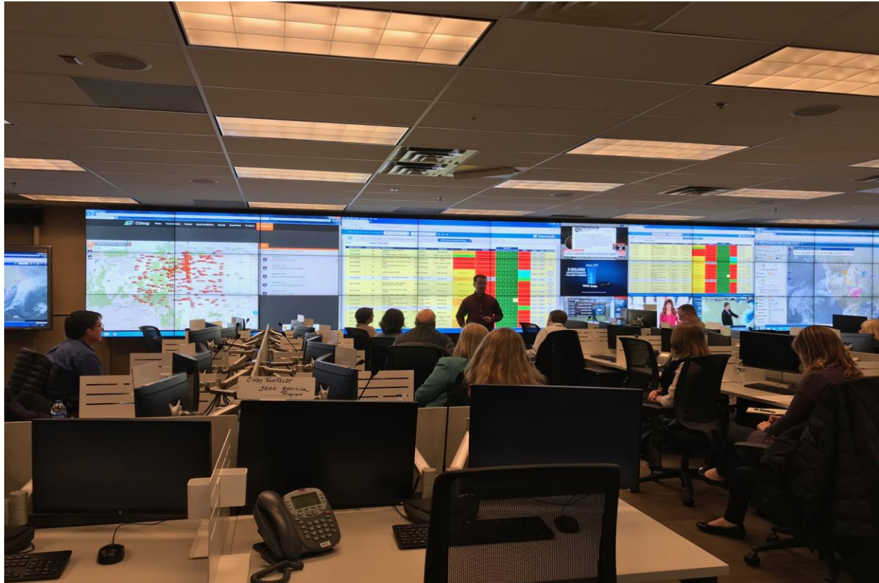
State Emergency Operations Center Tour on January 30, 2018

As a follow up to work that DHS started in Denver this year with the Communications Sector, CEPP arranged three tours of Emergency Operations Centers in Colorado: one at the State's Emergency Operations Center (EOC) in January; one at Denver's EOC in March; and one in Boulder's EOC, also in March.