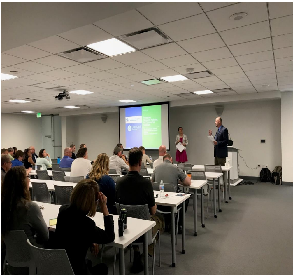
Protective Security Measures Workshop on May 24, 2018

Invitees included representatives from the Building Owners and Managers Association (BOMA) Denver Metro Chapter, International Facility Management Association (IFMA) Denver Chapter, and Denver Chamber.