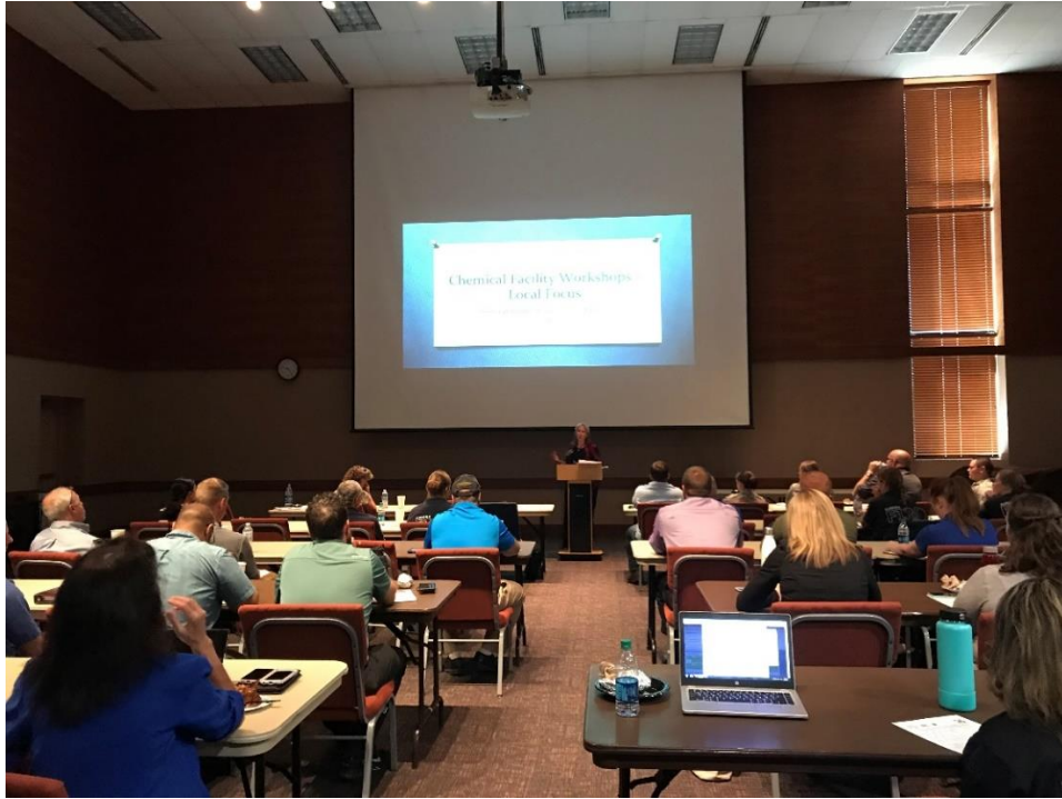
City of Aurora Chemical Safety Workshop on September 17, 2018