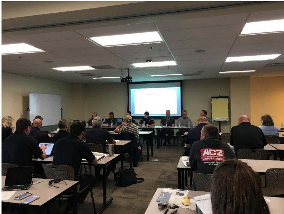
Routt County Chemical Safety Workshop on September 21, 2018