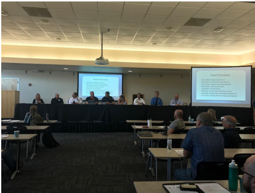
Arapahoe-Douglas County Workshop on June 5, 2018

Three Chemical Safety Workshops for regulated industry were held in 2018 for Arapahoe, Douglas, and Routt Counties and for the City of Aurora. The target audience for these workshops were the facilities that store and/or use hazardous chemicals in these counties, their response organizations and their LEPC's. The workshops' goals were to promote frank conversation about what will happen when a company dials 9-1-1 after a spill or release: what public resources are deployed; how long those resources will take to arrive; and how a company can help during an event. The overall purpose in bringing these groups together was to promote joint emergency planning by encouraging coordination with the counties' Local Emergency Planning Committees.